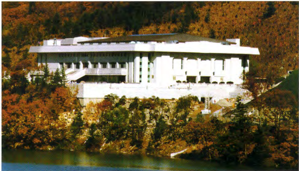
Cheonseong Wanglim Palace "The heavenly palace that descended"