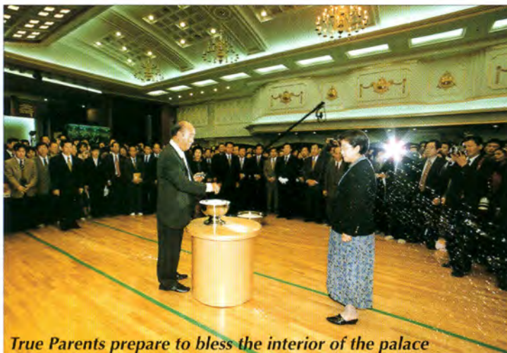
True Parents prepare to bless the interior of the palace

We know well how the history of restoration has been complicated in its course to resolve all problems in paradise, the intermediate spirit world and hell. We also feel deeply how miserable the providence has been in its course to restore the original consciousness, life and lineage through