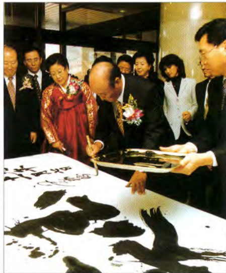
Above: Cheonseong Wanglim Palace from across the inlet at Chung Pyung Lake Right: Father writes a special calligraphy to commemorate the dedication of the palace. It reads, "The realm of the fourth Adam, the Kingdom of Heaven in heaven and on earth" Below: Members at the dedication ceremony take part in a treasure hunt in the palace grounds

Heaven to the cosmic level, the ideal of creation. The Unification Church has prepared the realm of the Kingdom of Heaven in heaven and on earth, spreading the blood lineage through the blessing