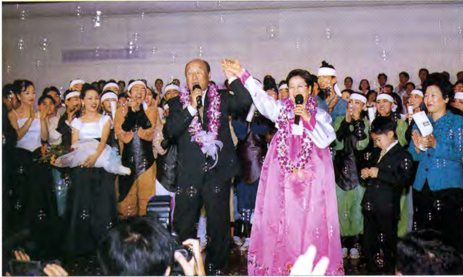
True Parents at the True Children's Day cultural evening at Cheonseong Wanglim Palace